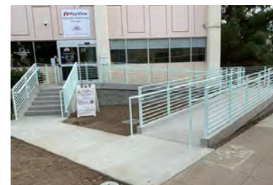
The new ADA ramp at our Palo Alto Clinic allows easy access for all visitors.

Through this closure, we were able to still ensure our delivery and access to our services continued for our patients in Palo Alto, diminishing any discrepancy in their health access and care. Staff ensured all patients were notified of the clinic closures and their options for care during the time of construction, and provided them the option to reschedule their appointments for a later time. Even in the course of the closure, we made sure we were not inhibiting our ability to provide critical medical services to our patients residing in Palo Alto. Ultimately, the addition of the ADA Ramp and motion detection entrance supports our Palo Alto Clinic in assuring all patients have the accessibility to enter our buildings and receive access to medical care.