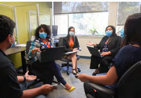
The Social Services Team meets to discuss enhanced care management.

Our patients will become educated, engaged, and empowered to actively manage their health and become advocates for healthy living within their family and the community, inspiring others to value good health as true wealth.